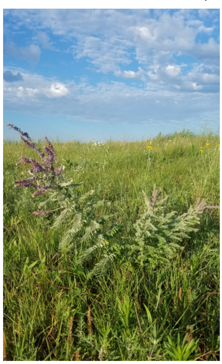
Leadplant, Amorpha canescens

Since the mid-2000s, there has been a dramatic change in pesticide use in agricultural fields in the US and around the world due to a class of pesticides called neonicotinoids. Currently, over 100 million acres of farmland in the US are planted with neonicotinoid-coated seeds each year. Research has shown that neonicotinoids are being greatly over-used in agricultural fields, with few or no benefits to the farmer in many cases. On the other hand, neonicotinoids are wreaking havoc on pollinators, beneficial insects and other wildlife.