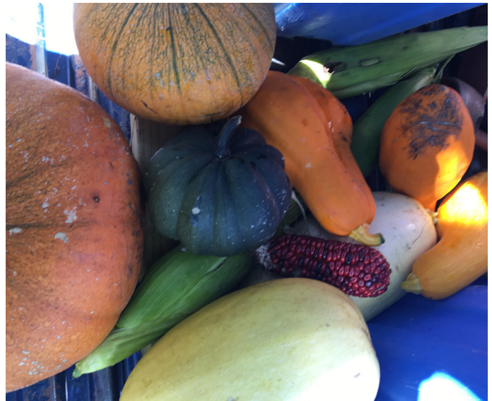
Pumpkins, squash, corn, and okra are common products of a milpa garden. Photo from Gail Fuller, Emporia.